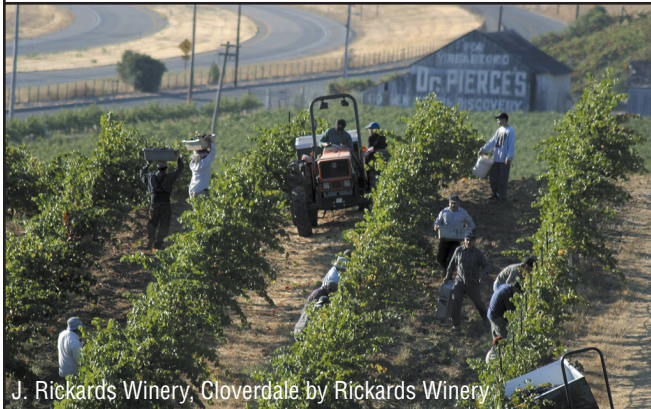
J. Rickards Winery, Cloverdale by Rickards Winery